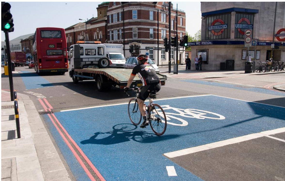
Above: Existing arrangement at a Signalised junction with an ASL