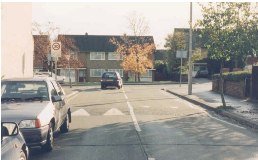
Fig 2.5b Signing on exit from the 20 mph zone