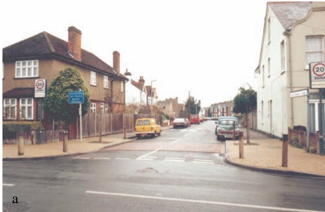
Figs 2.4a, 2.4b and 2.4c showing 20 mph zone signing and road narrowing at entrance gateway