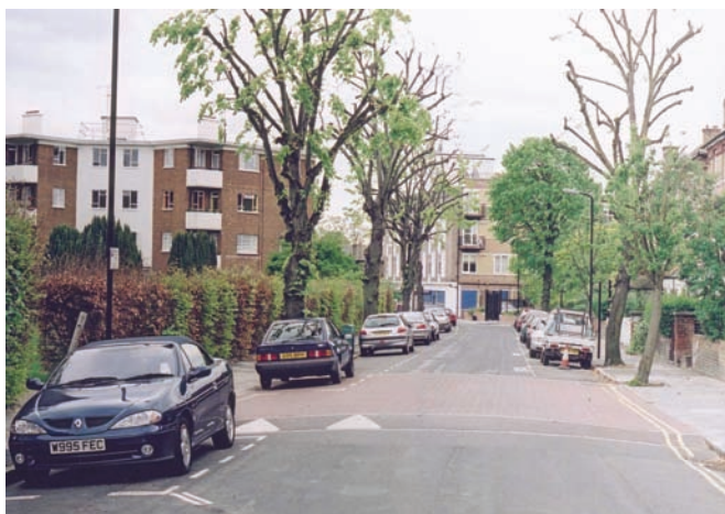
Fig 2.3d Flat-top hump and controlled parking bays