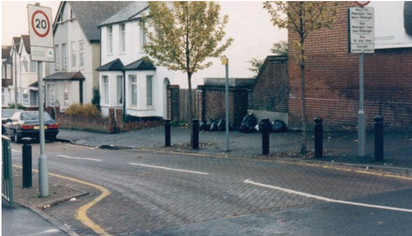
Fig 2.5a Road narrowing and signing at entry to 20 mph zone