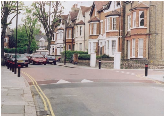
Fig 2.3c Raised junction