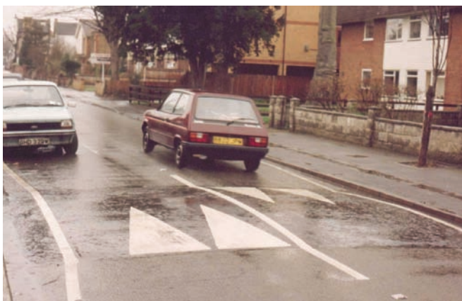
Fig 2.4d Round-top hump