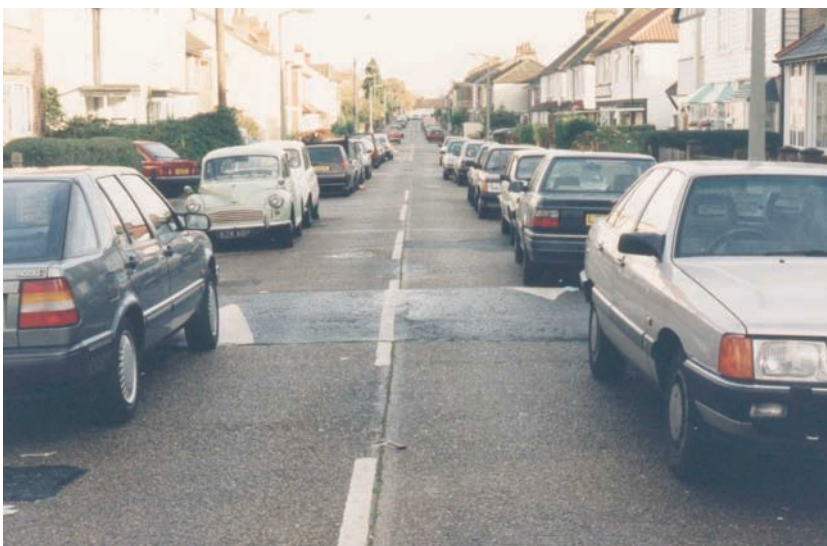
Fig 2.5c Parking along road with round-top humps